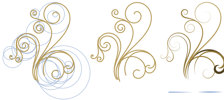
Figure 3: Refinement process example, from left to right: SVG file opened with Inkscape, Bézier segments connected, brushes and colours applied according to curve parameter (brushes shown below).

The SVG format is widely recognized by application, thus the user can use the whole toolset of her software to apply colours, strokes, brushes or textures the curves. Figure 3 demonstrates such a process.